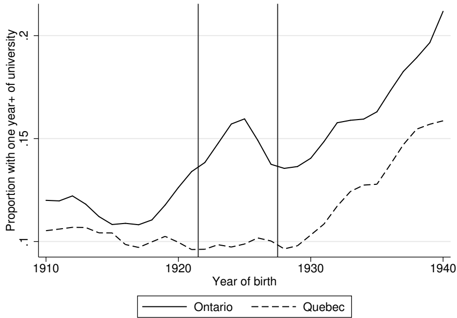
Figure 1: University attendance (%) by year of birth

or six, compared to eleven or twelve for their English speaking counterpart. Additionally, while under-prepared returning veterans from Ontario benefited from remedial programs, no such accommodation existed in Quebec. Consequently, even for those who volunteered in Quebec, the fact that their schooling level was well below high school made the VRA financial assistance program essentially irrelevant. The combination of lower educational attainment and lower participation rates in the war effort makes French Canadian men a potentially adequate control group for returning veterans from English-speaking Ontario.